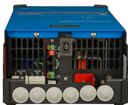
MultiPlus 2000 VA (bottom cover removed)