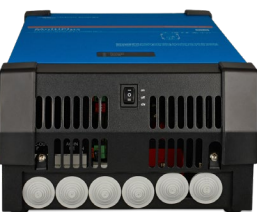
MultiPlus 2000 VA (with bottom cover)